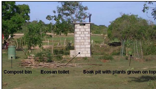
Photograph 1. Ecosan toilet in rural Sri Lanka

The technology used in Sri Lanka so far is the UDDT. The UDDTs in Sri Lanka are commonly referred to as “compost toilets”. The systems are all double vault systems. Photograph 1 shows a newly constructed compost toilet and its immediate surroundings in Hambantota district. The picture also shows a compost bin distributed by local NGOs to several households. A sustainable ecosan concept should be imbedded in a holistic solid and liquid waste management concept.