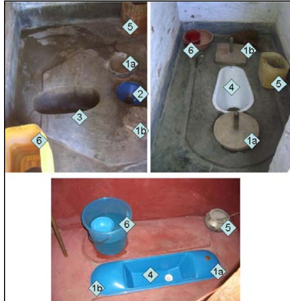
Photograph 2. Different squatting pans in Sri Lanka

from the oldest to the newest model. Additional models are just being developed by the NGO Practical Action.