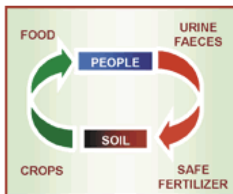
"Closing the Loop" on Sanitation

Even if the sanitation crisis can be communicated to and understood by more people, the need to find sustainable alternatives to conventional approaches for both developed and developing countries remains. Sanitation can no longer be a linear process where excreta is hidden in deep pits or flushed untreated downstream to other communities and ecosystems. Sustainable and ecological sanitation calls for a holistic approach.