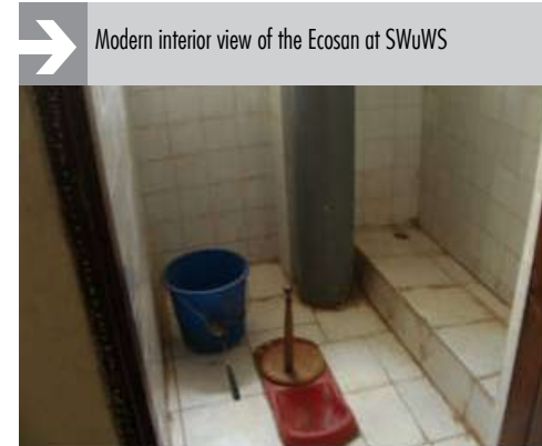
Modern interior view of the Ecosan at SWuWS

Not many people from the neighbourhood have constructed ecosan toilet because they prefer flush toilets while others are just poor to afford construction of ecosan.