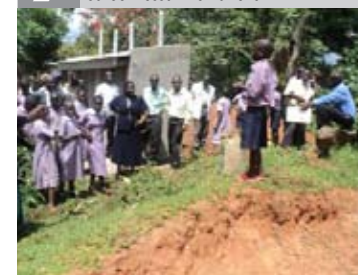
➔ A club member of P.5 talks about the school Fossa Altena toilet

In one of the schools management meeting it was suggested that the school should construct an incinerator, urinals for boys and wash rooms for girls