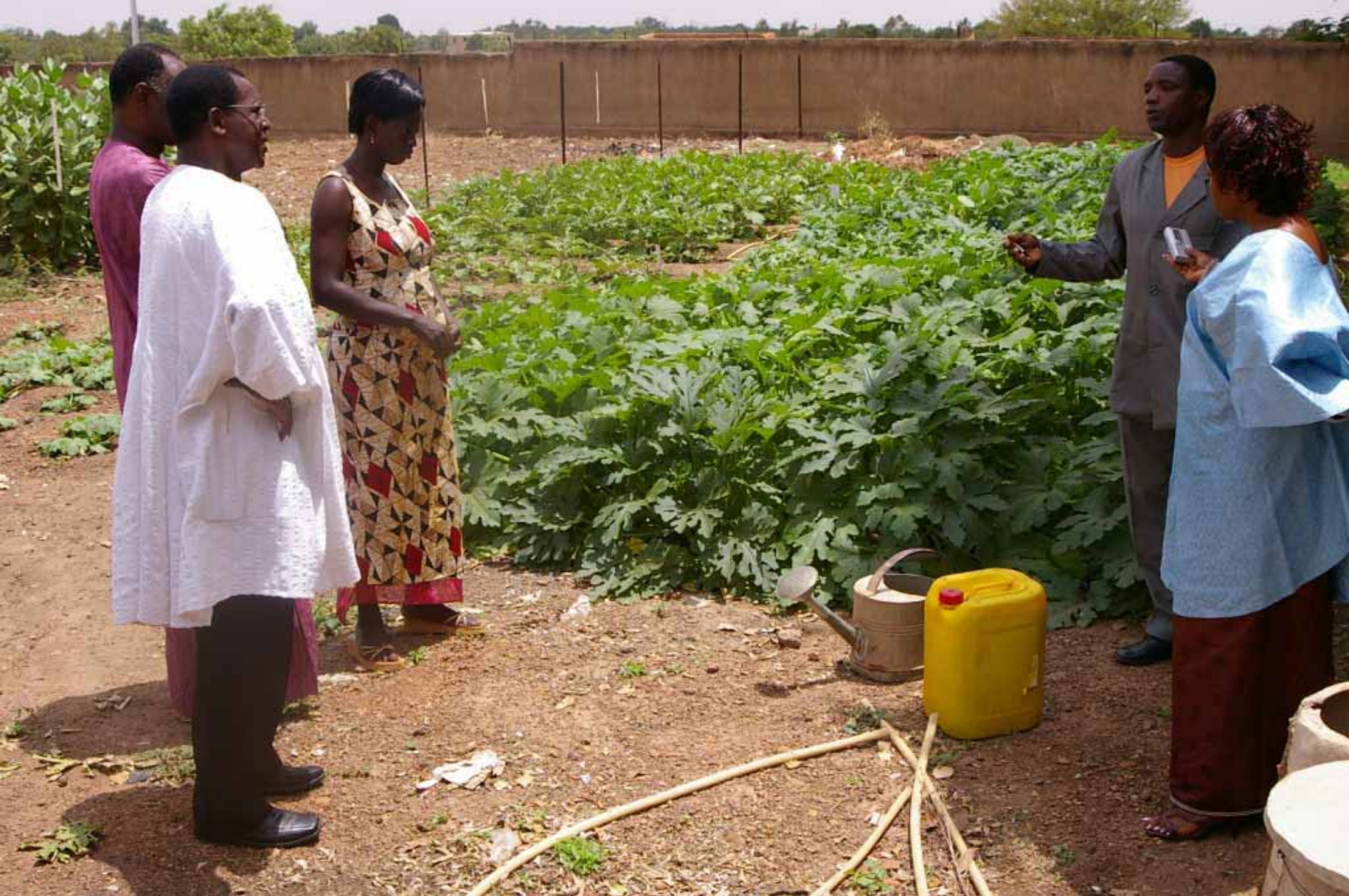
Minister of Agriculture visiting demo site